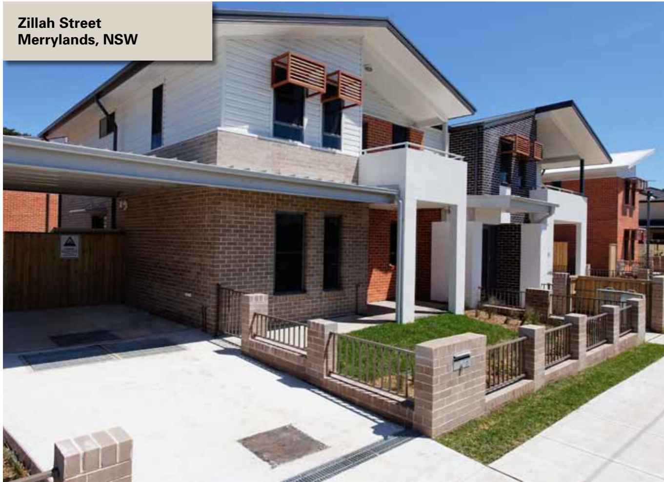
Zillah Street Merrylands, NSW