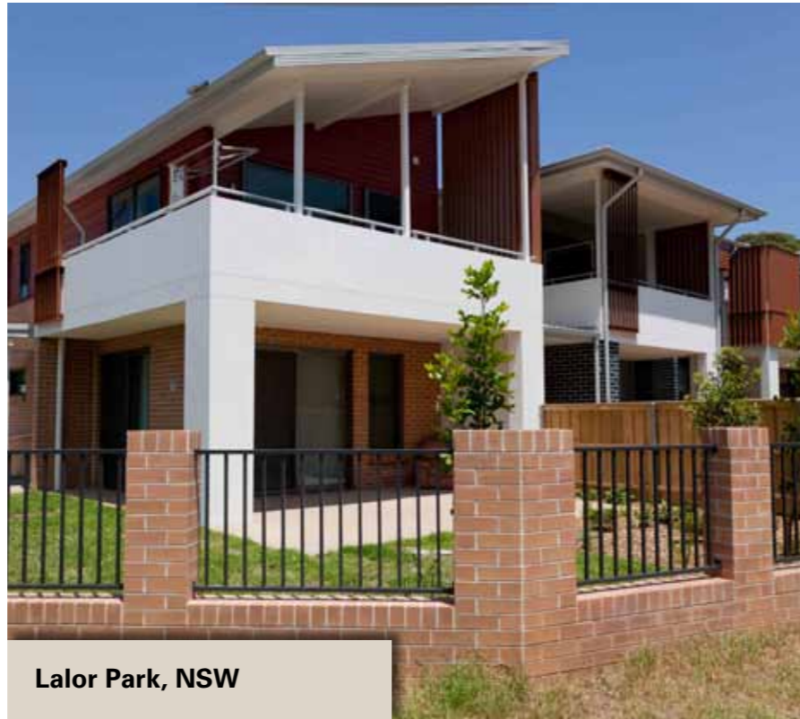
Lalor Park, NSW

Project Senior Living Units Location Western Sydney, NSW Client Housing NSW Project cost $18 million Completion November 2010